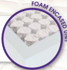
FOAM ENCASED UNIT

Provides full perimeter reinforcement with high density foam, making this mattress more durable. Increases usable sleep space by up to 20%.